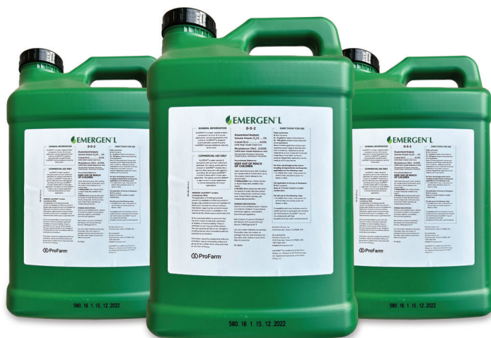
Emergen L is a patented liquid foliar fertilizer.